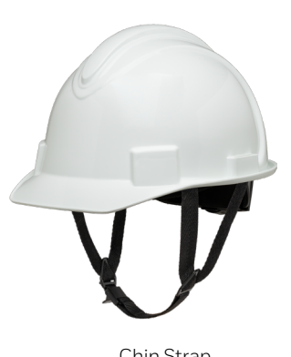
Chin Strap NSB100CS